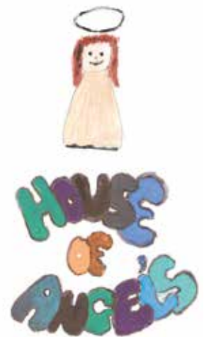
A child survivor of domestic abuse drew this beautiful picture of the LifeCare Women's Centre.

At LifeCare we take to heart God's call to love and serve the marginalised in our community. LifeCare is making a real difference in the lives of people who live in our local neighbourhood, so join the team and get involved in whatever capacity you are able!